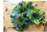
Play Dough Jungle